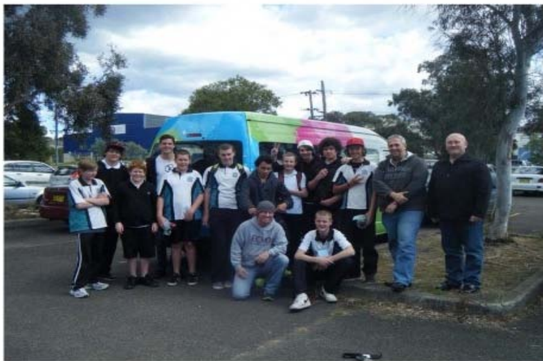
Thanks Year 8 Boys and a big thankyou to the mentors and looking forward to the next group.

Some of the students have volunteered themselves to assist as mentors for the next group which displays the leadership skills and determination they have to share the experience to others.